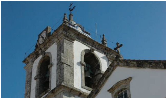
Bell Tower of the Igreja Matriz (Mother Church), Pedrógão Pequeno

The rights, freedoms and guarantees of the small municipality were confirmed on 20th October 1513, when King D. Manuel I granted a Town Charter. Pedrógão Pequeno's independence continued until 6th November 1836, when Minister Manuel da Silva Passos passed a decree dissolving this and other small municipalities across the country. The two parishes (Pedrógão Pequeno and Carvalhal) of the extinguished municipality were initially integrated into the County of Oleiros, but a new decree in 1837 placed them under the aegis of Sertã. Reduced to the status of a simple parish Pedrógão Pequeno received its first administrative authority, located first in the Junta de Paróquia and later in the Junta de Freguesia.