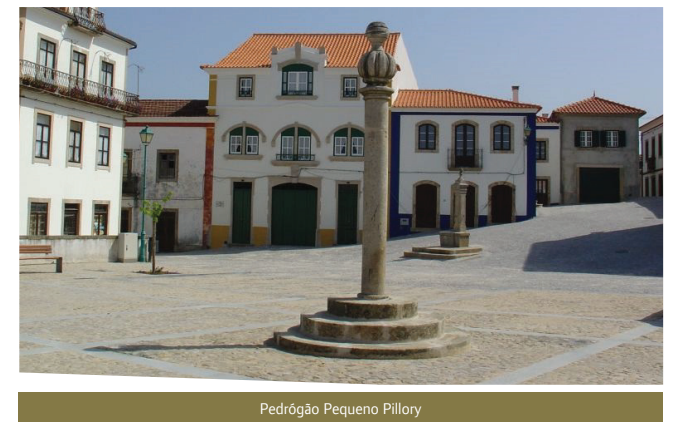
Pedrógão Pequeno Pillory

The rights, freedoms and guarantees of the small municipality were confirmed on 20th October 1513, when King D. Manuel I granted a Town Charter. Pedrógão Pequeno's independence continued until 6th November 1836, when Minister Manuel da Silva Passos passed a decree dissolving this and other small municipalities across the country. The two parishes (Pedrógão Pequeno and Carvalhal) of the extinguished municipality were initially integrated into the County of Oleiros, but a new decree in 1837 placed them under the aegis of Sertã. Reduced to the status of a simple parish Pedrógão Pequeno received its first administrative authority, located first in the Junta de Paróquia and later in the Junta de Freguesia.