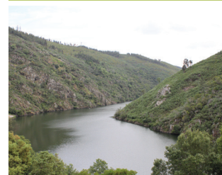
Moinho das Freiras – (Bouçã Reservoir)