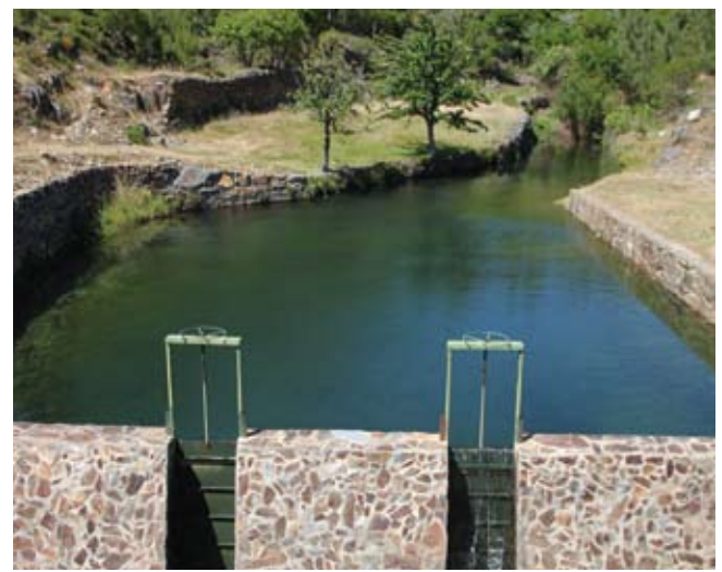
Riber Beach of Santinha

The parish of Figueiredo is 17 km from the municipality town capital, Sertã. It used to have an abbey granted by the Grand Prior of Crato, who, as well as being the head of the Knights of St John, also had the title of Prince (Infante, not in line for the throne) in the second half of the eighteenth century. Prince Pedro developed the village parish. The decree establishing the parish was signed by King John VI on August 21, 1817, but Figueiredo only began operating on June 12, 1826. Initially the boundaries had been incorrectly recorded which led to a revolt by the people. By 1826 the proper boundaries were finally restored. It was the last parish to be created in the municipality. The parish chapel is 20 km from the Sertã town and is located on the right bank of the stream of Isna, a tributary of the river Zêzere. It contains the villages of Castanheira Cimeira, Castanheira Fundeira, Dona Maria, Monte Fundeiro, Perna de Galego Cimeira, Perna de Galego Fundeira, Relvas and Sipote. Currently, the parish of Ermida serves the primary sector, with agriculture and forestry the main economic activities.