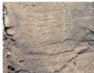
Prehistoric rock art site of Fechadura