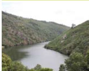
Moinho das Freiras (Bouçã Dam)