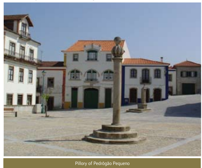
Pillory of Pedrógão Pequeno