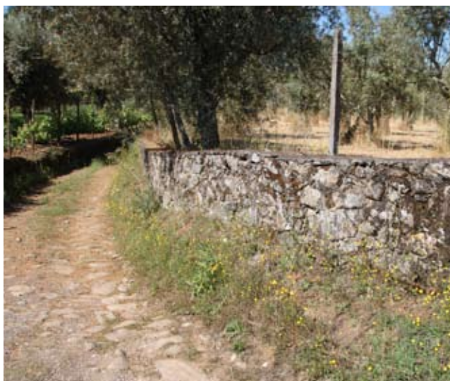
Roman Cobbled walk

A rolled almond pastry, Cernache style Fish soup Tripe A type of sausage with goat meat, rice and cured ham Two types of fried pastry donuts Arbutus Berry Liqueur Cheeses