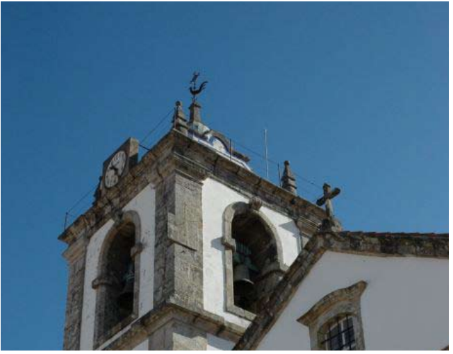
Church of St John the Baptist Bells